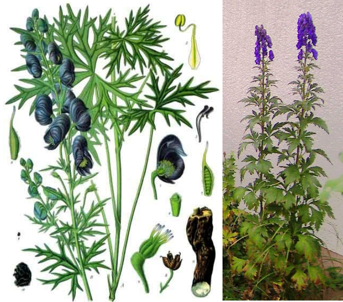
Aconitum Monkshood Delphinium