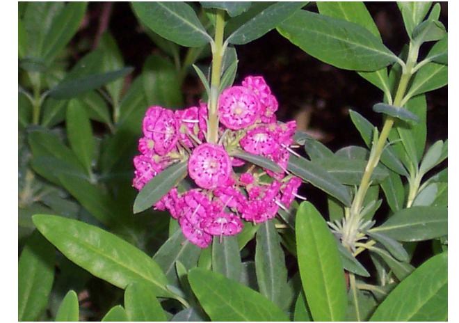
Lambskill, bog laurel Kalmia spp