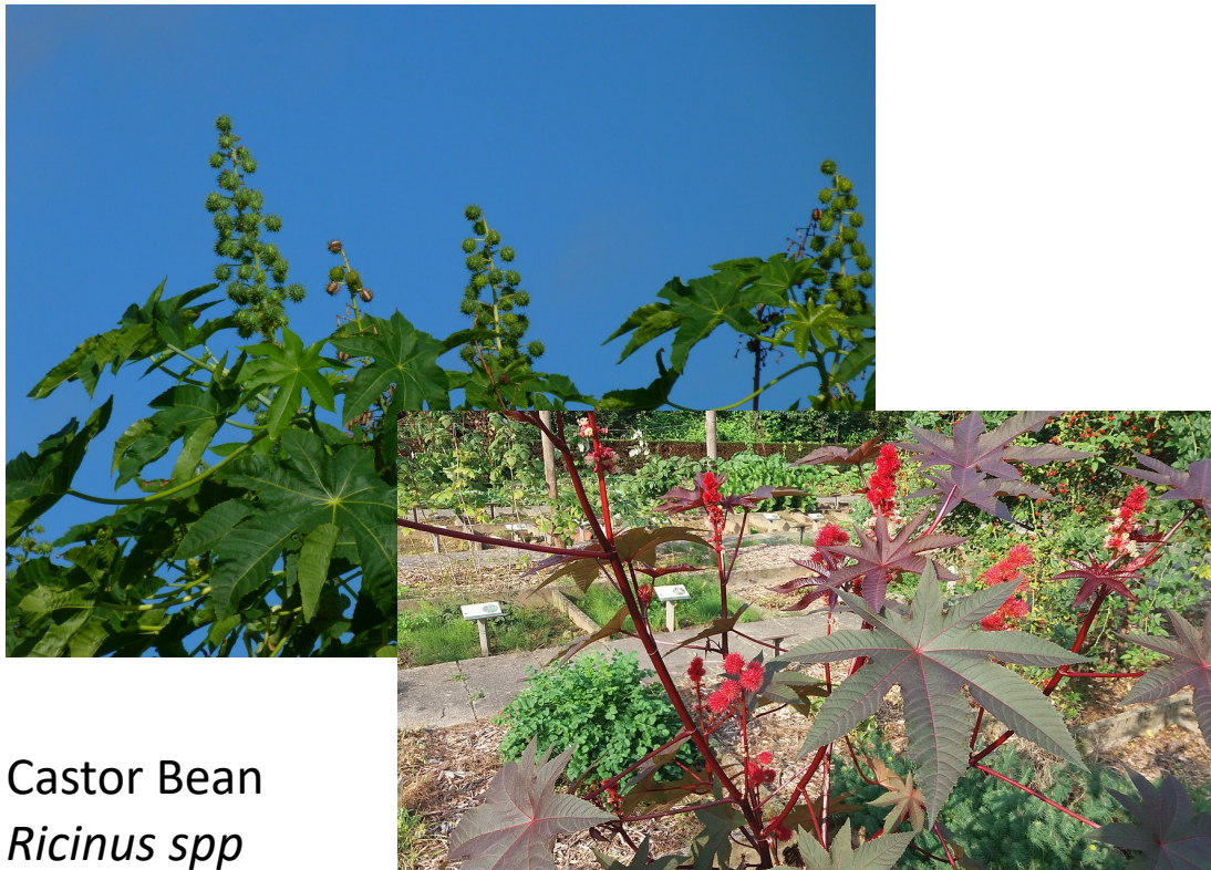
Castor Bean Ricinus spp