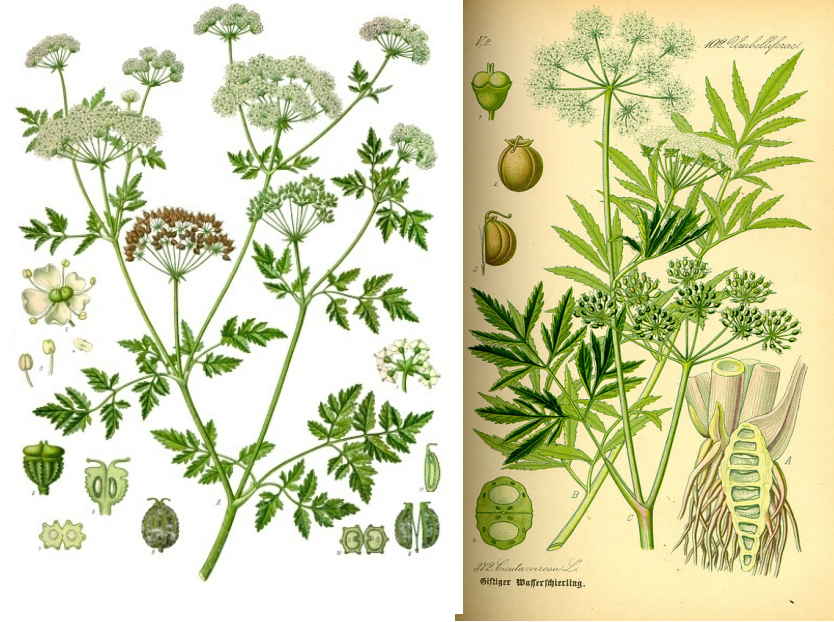
Water Hemlock, poison hemlock Cicuta virosa , Conium maculatum