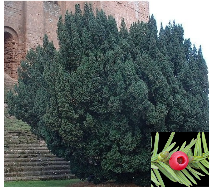
Yew Taxus spp